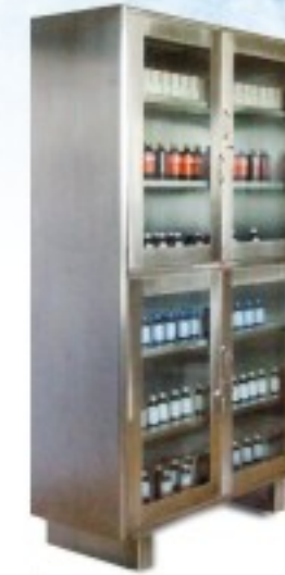
Glass Door Cabinet : MXGD

Product Dimensions : 01 - 1270 H x 760 W x 430 D 02 - 1675 H x 840 W x 430 D 03 - 1980 H x 915 W x 485 D 04 - 1980 H x 1018 W x 485 D