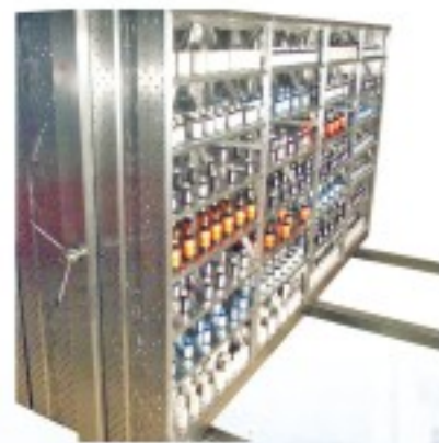
Mobile Storage System : MXMSS

Product Dimensions : 01 - 1270 H x 900 W x 350 D (15 Locker) 02 - 1675 H x 900 W x 350 D (21 Locker) 03 - 1270 H x 1200 W x 350 D (20 Locker) 04 - 1675 H x 1200 W x 350 D (28 Locker)