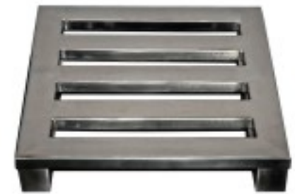
Pallet : MXP

Product Dimensions : 01 - 750 H x 900 W x 600 D 02 - 750 H x 1200 W x 750 D