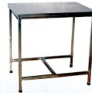
Work Table : MXWT

Product Dimensions : 01 - 750 H x 900 W x 600 D 02 - 750 H x 1200 W x 750 D