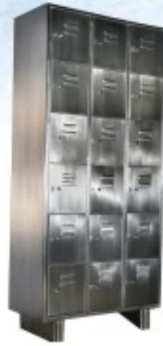
Staff Locker : MXIL

Over all Size : 1980 H x 915 W x 485 D Locker Size : 06 - 900 H x 300 W x 450 D (06 Locker) 09 - 600 H x 300 W x 450 D (09 Locker) 12 - 450 H x 300 W x 450 D (12 Locker) 18 - 300 H x 300 W x 450 D (18 Locker)