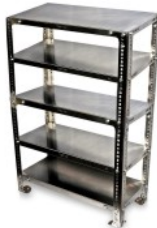
Slotted Angle Rack : MXSAR