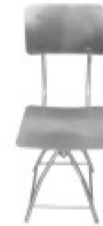
Chair : MXC

Models Available : Plain 3 Side Closed Shoe Locker from one side with Door Shoe Locker from both side with Door Shoe Locker on both side on alternate arrangement 450 H x 400 W x 900/1200/1500/ 1800/2000/2400mm L