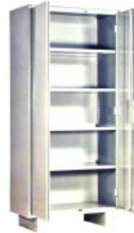
Storewell / Storewell with Locker : MXS / MXL

Over all Size : 1855 H x 380 W x 485 D Locker Size : 01 - 1855 H x 380 W x 450 D (01 Locker) 02 - 900 H x 380 W x 450 D (02 Locker) 04 - 450 H x 380 W x 450 D (04 Locker) 06 - 300 H x 380 W x 450 D (06 Locker)