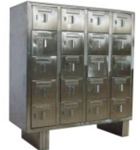
Shoe Locker : MXSL

Product Dimensions : 01 - 1270 H x 900 W x 350 D (15 Locker) 02 - 1675 H x 900 W x 350 D (21 Locker) 03 - 1270 H x 1200 W x 350 D (20 Locker) 04 - 1675 H x 1200 W x 350 D (28 Locker)