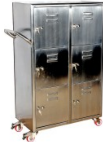
Moving Trolley : MXMT

Product Dimensions : 01 - 900 H x 1200 W x 600 D