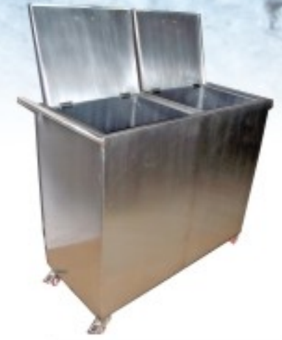
Garment Discard Trolley : MXGDT

Product Dimensions : 01 - 1980 H x 915 W x 485 D