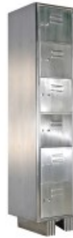
Personal Locker : MXPL

Over all Size : 1980 H x 915 W x 485 D Locker Size : 06 - 900 H x 300 W x 450 D (06 Locker) 09 - 600 H x 300 W x 450 D (09 Locker) 12 - 450 H x 300 W x 450 D (12 Locker) 18 - 300 H x 300 W x 450 D (18 Locker)